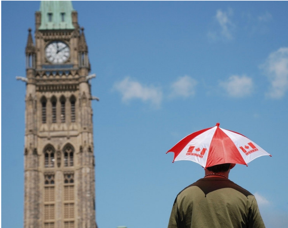
O Canada! - Ottawa, Canada, 1 July 2008: O Canada, the national anthem, rings out proudly on July 1st, Canada Day, accompanied by a sea of red and white. Here, in front of Parliament, the atmosphere is festive and patriotic, with flags waving, people singing, and the heart of the country pulsing with celebration.