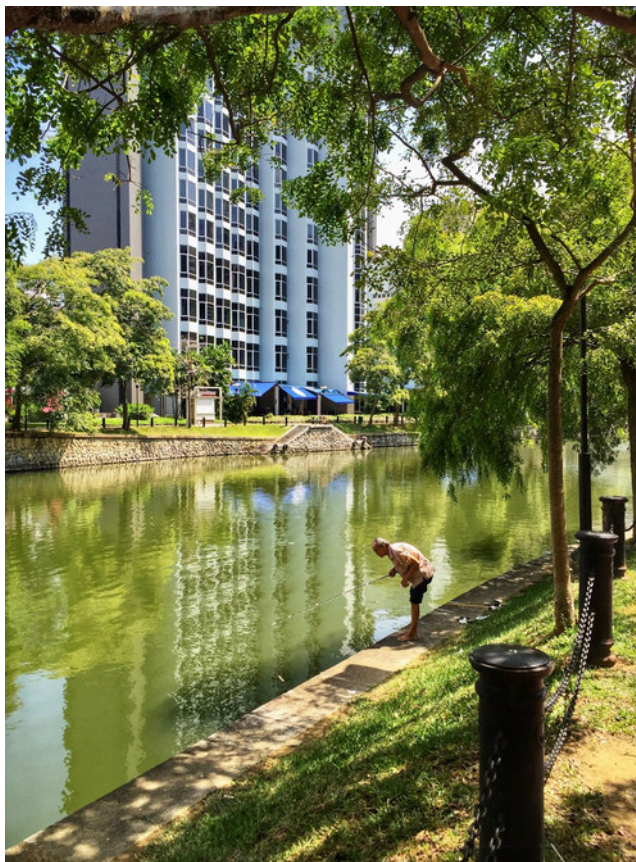
Happy Fish - Singapore, 3 July 2016: Fishing in the Kallang River in Singapore is an activity reminiscent of the good old times. Among the modern skyline and busy urban life, older men cast their lines peacefully. Do they catch anything? Is it the point?