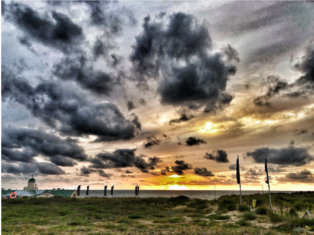
Sunset - Noordwijk, 6 July 2019: A sight that never fades: clouds backlit by the last glimmers of the sun, casting a gentle glow over the horizon and marking the quiet end of the day.