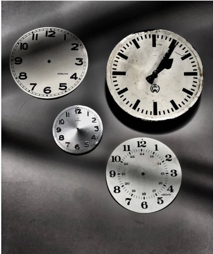
Counting Out Time - Dordrecht, 7 July 2018: A gentle nod to Genesis with this photo of multiple clocks without hands used as a wall decoration in a hotel.