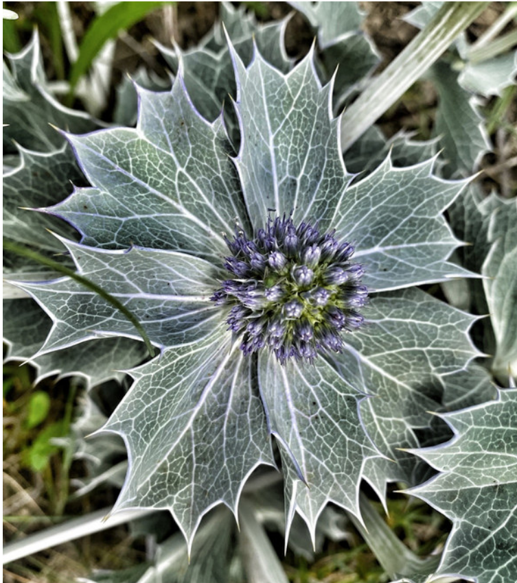
Pricky - Noordwijk, 5 July 2021: Thistle is a tough and resilient plant, growing on sand in the dunes. A symbol of the endurance of the Dutch people in their centuries-long battle against the sea.