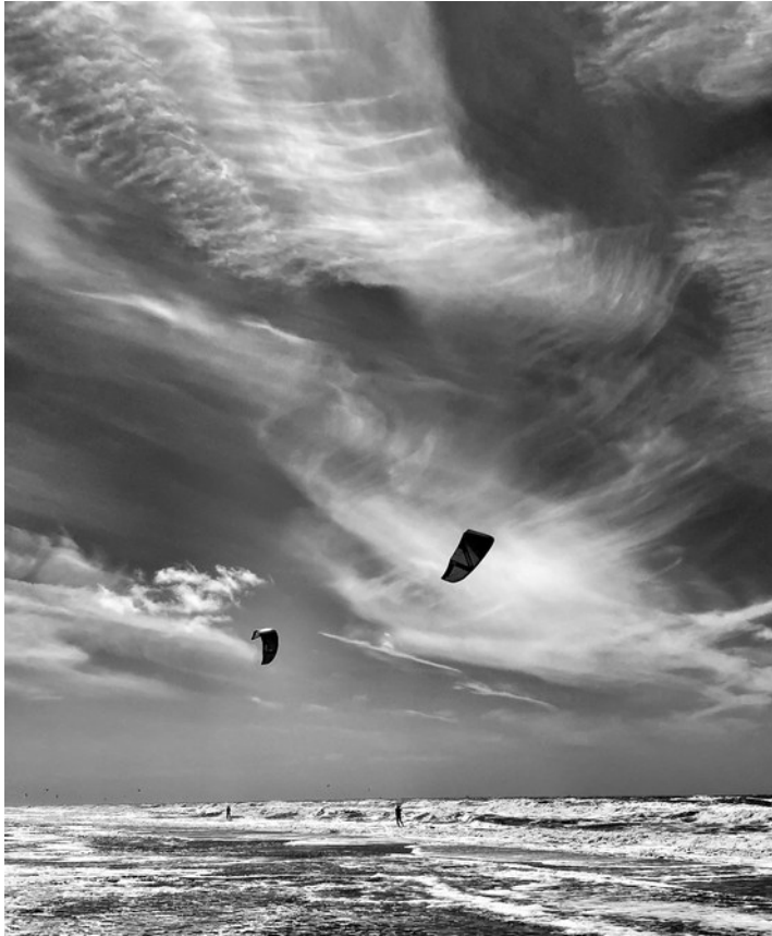
Dancing in the Sky - Noordwijk, 2 July 2023: The kitesurfers off the shore of Noordwijk move like dancers carried by the wind, graceful, swift, and in perfect harmony with the waves and clouds.